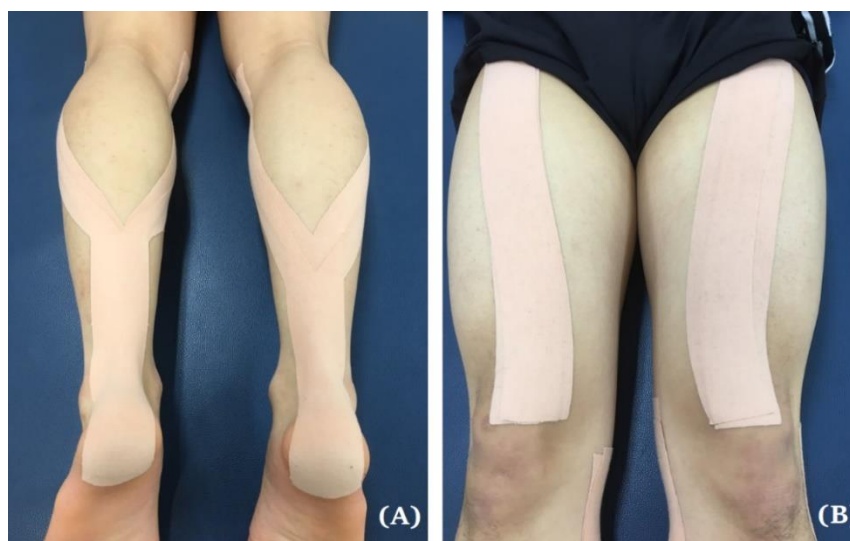
Figure 2. (A) Kinesio taping with double-taped application to the calf muscle; (B) Kinesio taping with double-taped application to the rectus femoris.