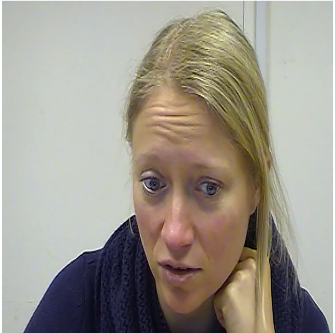
Fig 2. Images of guilty expressions taken from a video. AUs 1+4+10+12+(20+)25+26+Neck Touch produced in this image; the perceived production of AU20 might be due to speech at the same time (participant apologising). The individual pictured in Fig 2 has provided written informed consent (as outlined in PLOS consent form) to publish their image alongside the manuscript.

https://doi.org/10.1371/journal.pone.0231756.g002