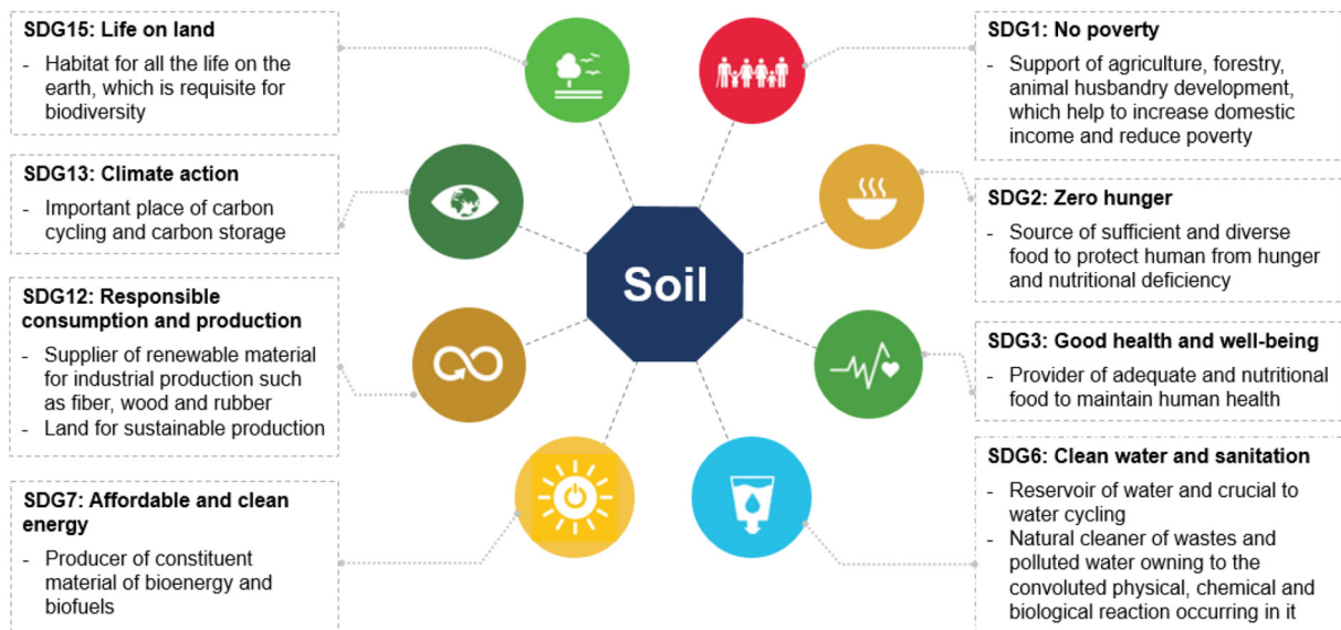
Fig. 1. The relevance of soil to the United Nations' Sustainable Development Goals (SDGs).

Assessing soil health involves the selection of indicators, quantification or qualitative scoring, and providing a final index with appropriate weighting and integration (Rinot et al., 2019). Biophysical indicators are particularly relevant for assessing soil health. This is because healthy soil is manifested through a variety of soil functions that are reliant upon biological processes, e.g. carbon transformation, nutrient cycling, maintaining soil structure, and regulating pests and disease (Kibblewhite et al., 2008). Scientists have explored the use of soil microorganisms (Nielsen et al., 2002; Van Bruggen and Semenov, 2000), enzyme activities (Ananbeh et al., 2019; Janvier et al., 2007), earthworms and nematodes (Neher, 2001), as well as other biological indicators to assess soil health. Similarly, soil structure, compaction and moisture retention have been used as physical indicators of soil health.