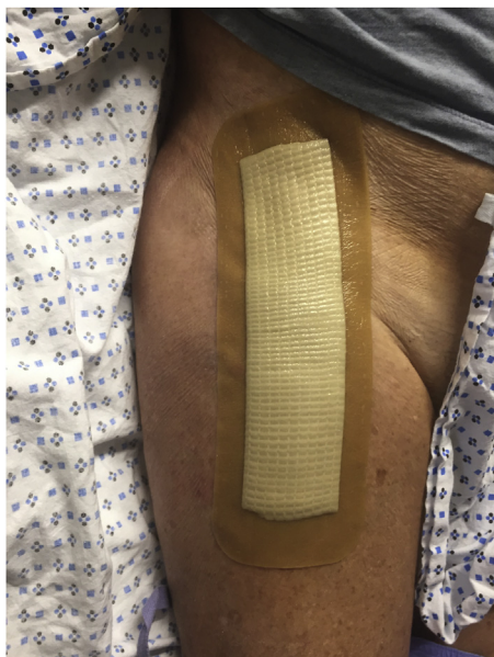
Figure 2. A postoperative patient with the standard dressing.

When comparing the mesh and standard dressing groups, no significant differences in demographics (Table 1) were observed. In addition, there were no significant differences in risk factors for wound healing complications including American Society of Anesthesiologists score, body mass index, diabetes mellitus, history of smoking, chronic kidney disease, or the number of patients taking immunosuppressant medication in either cohort. The total length of surgery was comparable between groups.