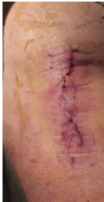
Figure 3. A postoperative patient with the clear mesh dressing.

We observed 22 cases (6.8%) of delayed wound healing in this patient cohort (Table 3). Seven cases of delayed wound healing occurred in the mesh group and 15 in the standard dressing group (3.8% vs 10.9%; P = .01). There was no significant difference in reoperation rate due to wound complications in the mesh group compared with the standard dressing group (2 [1.1%] vs 2 [1.5%], P = .76). The rate of deep infections was also not significantly different in the mesh group compared with the standard dressing group (2 [1.1%] vs 1 [0.7%], P = .75).