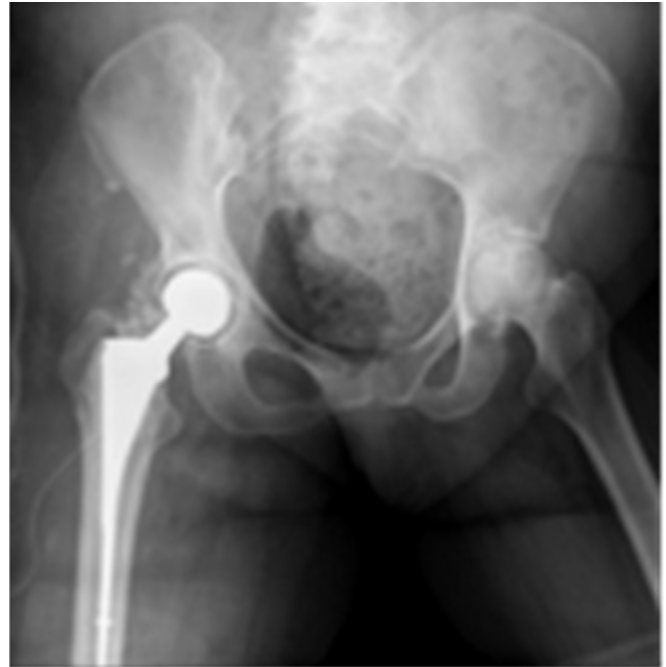
Figure 2. Articulating spacer in case 1.

A 69-year-old woman with a preoperative body mass index (BMI) of 30 kg/m 2 and a past medical history of rheumatoid arthritis presented with a painful right THA. She underwent a right THA in January 2017 (Fig. 1). Twenty-two days postoperatively, she developed increasing pain, erythema, swelling, and drainage. On initial presentation, she had an erythrocyte sedimentation rate (ESR) of 100 mm/hr (Ref: 0–15 mm/hr), a C-reactive protein (CRP) of 24 mg/dL (reference: ≤ 0.6 mg/dL), and aspiration showed a synovial white blood cell (WBC) count of 17,650 cells/mm 3 with 54% neutrophils. She underwent DAIR in February 2017, and 5 of 5 cultures grew Corynebacterium striatum . She had persistent drainage after surgery, and 2 weeks later, she underwent resection arthroplasty with placement of an articulating antibiotic spacer (Fig. 2). The patient's host and extremity status were B2. The patient met MSIS major criteria with 2 positive cultures for C. striatum . She completed antibiotic therapy with intravenous (IV) vancomycin for 6 weeks without additional oral antibiotics. Unfortunately, she had increased pain in her hip in August 2017. Laboratory tests showed her ESR had increased from 9 mm/hr in May to 22 mm/hr in August 2017; her CRP had increased from 4.4 mg/dL in July to 22.7 mg/dL in August 2017; and her aspiration had changed from 4 cells/mm 3