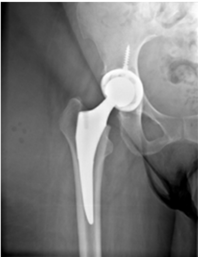
Figure 1. THA at presentation in case 1. THA, total hip arthroplasty.

with 60% neutrophils in July to 1446 cells/mm 3 with 60% neutrophils in August 2017. It was decided that she may not have cleared her infection, or she had infection recurrence. In September 2017, she underwent a spacer exchange to another articulating spacer. From this surgery, 2 of 2 intraoperative cultures were positive for Enterococcus faecalis . She did well postoperatively, and aspiration before reimplantation showed a WBC count of 55 cells/mm 3 with 8% neutrophils. Reimplantation was performed in May of 2018. She developed recurrent E. faecalis PJI 1 year later and underwent resection and placement of an articulating spacer. The current plan is to retain the articulating spacer if the patient has reasonable pain control and function. Any future infection or failure will likely be treated with a definitive resection arthroplasty. Her most recent clinical follow-up was August 2019, giving 30 months of follow-up.