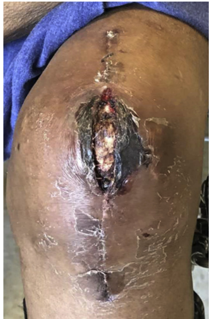
Figure 5. Wound dehiscence in case 3.