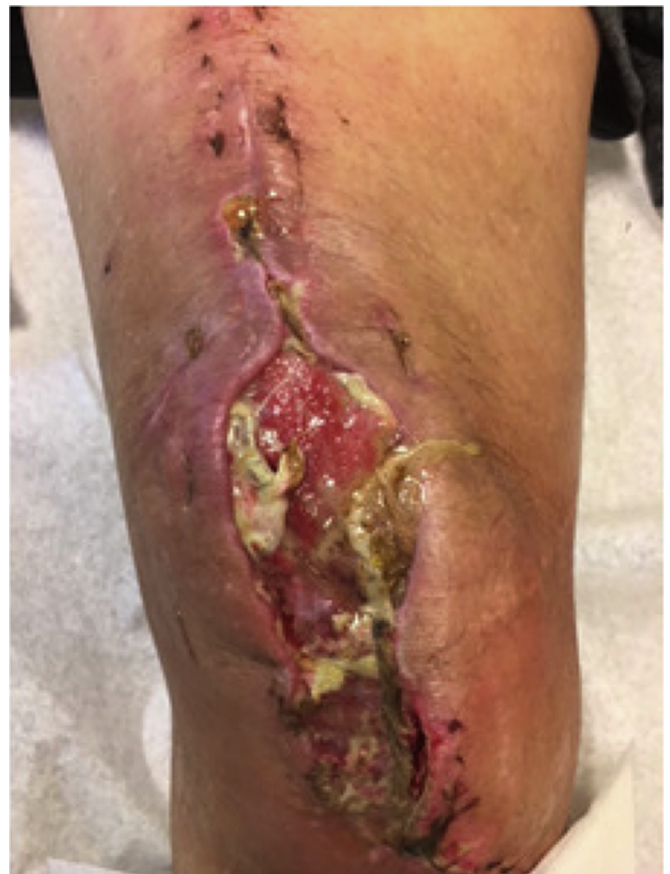
Figure 7. Poor wound healing with drainage after resection and before AKA in case 5. AKA, above-knee amputation.

A 72-year-old female with a preoperative BMI of 36.13 kg/m 2 and past medical history significant for rheumatoid arthritis presented with a chronic, right THA PJI. She had her index surgery at our institution in 2012. In 2013, she underwent revision for aseptic loosening of her acetabular component. In 2015, the patient had a custom triflange acetabular component for pelvic discontinuity. In March 2015, 2 weeks after her revision, the patient was noted to have persistent drainage at her first post-operative visit, concerning for PJI. From March to December of 2015, she was treated with multiple DAIRs, with intraoperative cultures over this time period coming back positive for a variety of organisms including Escherichia coli , vancomycin-resistant E. faecium , Proteus vulgaris , and Serratia marcescens . The patient eventually underwent resection arthroplasty in December of 2015. The patient was stable on suppressive cephalexin until May 2018 when she presented with a sinus tract about the hip. Blood work showed an ESR of 108 mm/hr