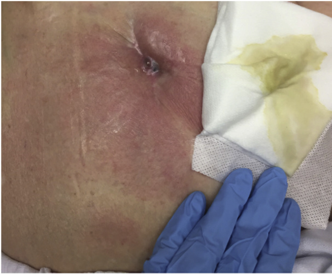
Figure 6. Draining sinus tract at presentation in case 4.

of 6 intraoperative cultures grew C. striatum , meeting major MSIS criteria for PJI. Her host and extremity status were A2. She received 8 weeks of IV vancomycin and ertapenem postoperatively. She was placed on ertapenem in addition to vancomycin because one of 6 intraoperative cultures grew Mycobacterium avium , and at presentation to our institution, she had a chronic sinus while on ampicillin and doxycycline. In August of 2019, she showed no signs or symptoms of infection, ESR and CRP remained within normal limits, and an aspiration of the hip had no microbial growth. She underwent reimplantation in November 2019. Seven weeks after her reimplantation, she suffered a dislocation that could not be closed reduced. She therefore underwent open reduction and her femoral head was exchanged from a 36- to 40-mm head. Ten weeks after her reimplantation, she presented to the emergency department with fevers and chills as well as new erythema and drainage at her incision site. The ESR was 129 mm/hr, CRP was 22.9 mg/dL, and joint aspirate was positive for E. faecium . She subsequently underwent DAIR in January of 2020. Four of 4 intraoperative cultures were positive for E. faecium , and 2 of 4 cultures were positive for Staphylococcus epidermidis . She was placed on a 6-week course of IV vancomycin. Her most recent follow-up was in February 2020, giving 9 months of follow-up.