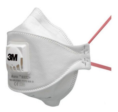
Fig. 4 FFP3 mask

recognized in these times due to regulatory restrictions, but also as many patients try to avoid showing up for a follow-up in hospital or the outpatient environment because they are afraid of nosocomial infections. It has also been shown that the use of telemedicine for the first consultation to an orthopaedics oncology service is highly cost-efficient, as it leads to a decrease in health-care cost between 12.2% and 72% [5].