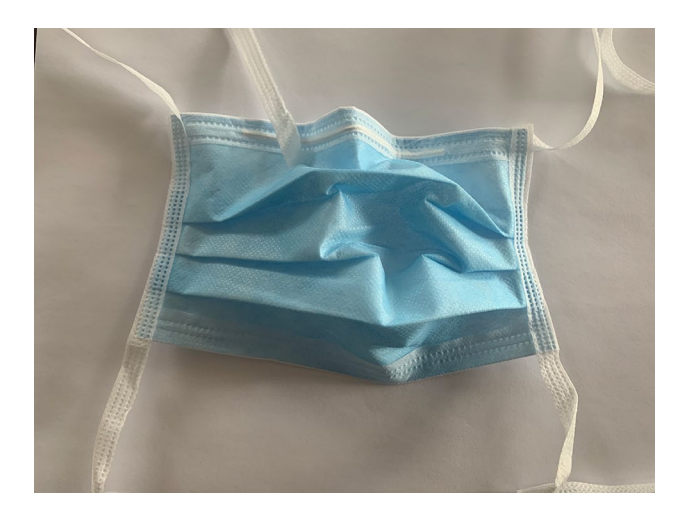
Fig. 2 Surgical mask

Telemedicine has been recognized as an efficient tool for providing electronic personal protective equipment (ePPE) to health-care workers [32]. It might help to protect staff and save PPE while providing rapid access to emergency care in orthopaedics. Under certain circumstances, the service can be provided with limited direct physical patient contact. In