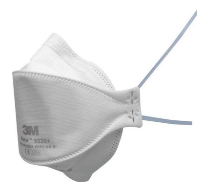
Fig. 3 FFP2 mask