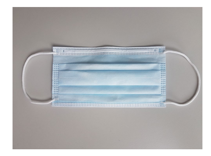
Fig. 1 Single-use face mask

measures should include double gloving with outer glove renewals during at-risk procedures.