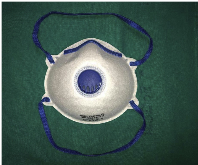
Figure 3. Filtering face piece 2 standard.

conducted to analyze the impact of each protective measure demonstrated that N95 respirators and surgical masks have similar protective effect. 2