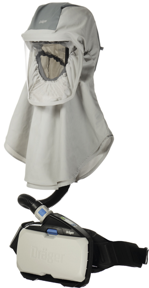
Figure 4. Powered air-purifying respirator (Dräger X-plore 8000; Drägerwerk AG & Co KgaA, Lübeck, Germany).

A systematic review and meta-analysis of observational studies and RCTs published in 2017 confirmed both PPE to be effective in protecting against severe acute respiratory syndrome (odds ratios, .13 [95% CI, .03 -. 62 ] for surgical masks and .12 [95% CI, .06 -. 26 ] for N95 respirators). Corresponding to previous reports, N95 respirators did not confer superior protection against viral infections or influenza-like illness compared with surgical masks, but they were demonstrated for the first time to be more effective in protecting against general clinical respiratory illness