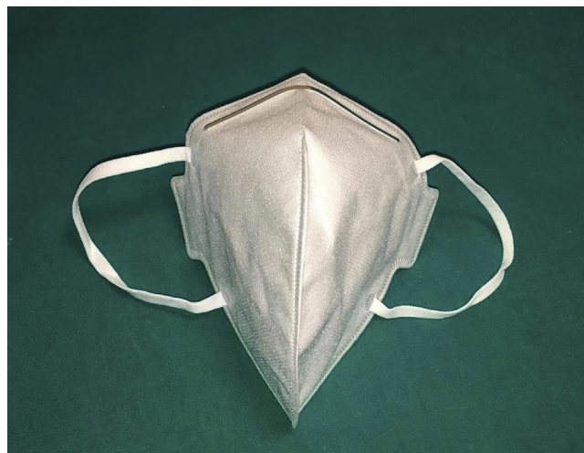
Figure 2. N95 respirator.

easily available in the hospital environment, is now scarce and precious. This situation, driven not only by the number of COVID-19 cases but also by misinformation, panic buying, and stockpiling during a pandemic, is of tremendous concern especially for the health community that is at greatest risk for exposure. Digestive endoscopists are among those at highest risk to infection because of aerosolization during procedures. Reducing the use of PPE through the postponement of elective and nonurgent outpatient clinical procedures does not sufficiently compensate for the scarcity of these goods. Moreover, an increase in the production of PPE would require a time interval that many health systems cannot afford given the speed of the spread of the infection.