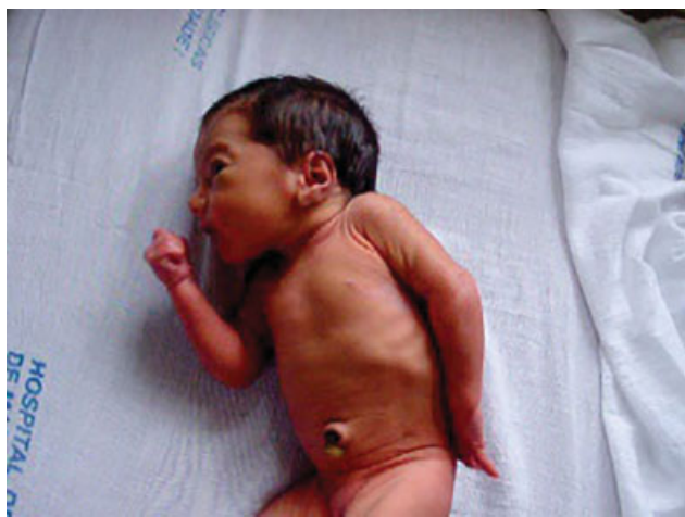
Fig. 2 Erb's obstetric paralysis.

roots; and low palsy, or Klumpke (C8-T1), in which the forearm and hand muscles are the most affected. The severity of the injury depends on the affected roots and its extent.