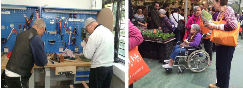
FIGURE 3 Participant photos illustrating activity participation. Left: older friends in a workshop together. Right: older people participating in outdoor activities

once saw this older person using an electronic wheelchair. It was quite convenient... [This] is very helpful for older people to gain autonomy."