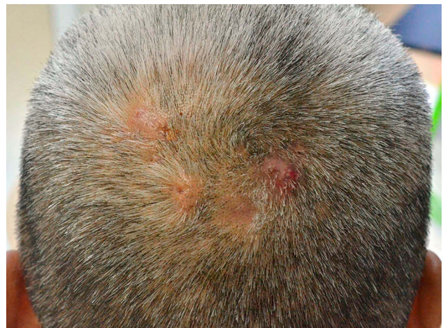
Figure 2 Pseudocyst of the scalp/alopecic and aseptic nodules of the scalp: soft and dome-shaped alopecic nodules, slightly erythematous and pustules on surface, surrounded by an area of normal skin.

The etiology remains questionable. Some authors assumed that it was a spectrum of follicular occlusions that cause deep folliculitis, leading to non-scarring alopecia and eventually a pseudocyst formation. Some believed that the follicular occlusion was only a predisposing factor as it was not observed in every case. In our opinion, the PCS/AASN