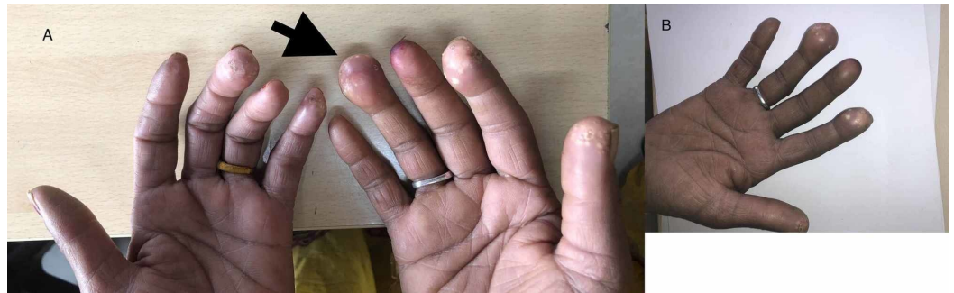
FIGURE 1: (A, B) Showing grouped white to yellowish papules on the finger pads (black arrow)

D3, thyroid function and parathyroid hormone (58 ng/ml, normal 10-75 ng/ml) levels were within the normal range. In addition, her 24-hr urinary calcium was also within the normal range. The workup for connective tissue disorders was negative (Antinuclear antibodies, anti-Scl-70, anti-Ro, anti-La, anti-Jo-1 antibodies were negative). Our patient refused skin biopsy. After ruling out metabolic causes, autoimmune disorders and malignancy, we made the final diagnosis of idiopathic calcinosis cutis. The patient was prescribed oral diltiazem (60 mg, 1 mg/kg) and was followed for the next three months. Though her lesions were not progressive, there was no significant improvement after diltiazem therapy.