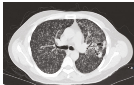
FIGURE 2: Thoracic CT scan without contrast demonstrating numerous, bilateral tiny nodular densities, most prominently in the upper lobes and confirmed a lingular cavitory lesion.

His chest X-ray revealed diffuse bilateral reticulonodular opacities and airspace disease with a possible lingular cavitory lesion (Figure 1). A thoracic CT without contrast was obtained which revealed numerous, bilateral tiny nodular densities, most prominently in the upper lobes, and confirmed the lingular cavitory lesion (Figure 2). A few scattered mediastinal lymph nodes were also noted. Serum chemistry was remarkable for an anion gap of 35, beta-hydroxybutyrate of 8.09 mmol/L, and blood glucose of 532 mg/dL. Hematology showed a white blood cell count of 13 000/ \mu L with 0% eosinophils. Venous blood gas analysis revealed a pH of 7.13, pCO 2 of 32, and lactic acid of 5.46 mmol/L. Urinalysis was positive for 4+ glucose and 3+ acetone. Later, HIV antigen testing for types 1 and 2 was negative and CD4 count was 343 cells/ \mu L. Vancomycin 1 g and piperacillin/tazobactam 3.375 g were given intravenously in the emergency department. Intravenous insulin was started with dose adjustment according to an in-house nursing algorithm alongside vigorous hydration.