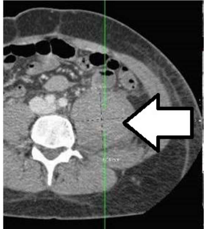
Figure 3. CT scan of an iliopsoas muscle hematoma in a hemophilic patient.

The combination of hematological treatment and radiotherapy can be used in pseudotumors located in the distal parts of the extremities, especially when there is a contraindication for surgery. Radiation should be done in small doses of 2 Gy or less until a total dose of 6-23.5 Gy is reached, which is the recommended radiation dosage (13).