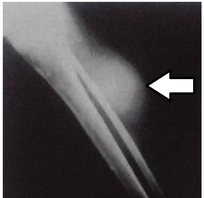
Figure 1. Radiograph of a pseudotumor of the tibia (arrow) secondary to a recurrent muscle hematoma in the area.

In one study, 49 cystic lesions were analyzed in 37 hemophilic patients (10). Their average age was 23 years and the mean follow-up was 10 years. The locations of the lesions were as follows: 24 (49%) in the tibia, seven (14.4%) in the ulna, six (12.2%) in the talus (12.2%), five (10.2%) in the humerus, five in the femur (10.2%) and two (4%) in distal radius. After aspirating the