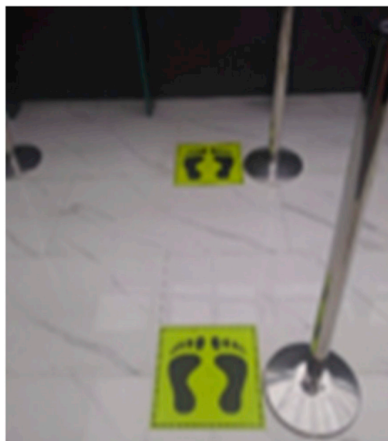
Fig. 1. Maintaining social distancing. (image reproduced with permission)

(33%) alongwith numerous actions taken towards social distancing such as telephone consultations, educating patients, and disseminating information on handwashing and mask usage. PPs reported that their organizations were taking steps to address fear and anxiety among staff. (See Fig. 1 and 2 )