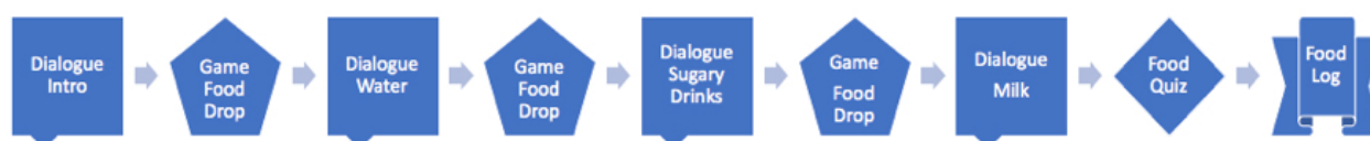
Figure 3. Foodbot Factory game flow diagram for Drinks module.

Foodbot Factory employs multiple gamification characteristics, as defined by the Taxonomy of Gamification Concepts for Health Apps and highlighted in Multimedia Appendix 3 [47]. In summary, the app utilizes mediated communication where information is delivered through a guided storyline. Rewards are received within the app, and there is no competition with other players or opportunities for collaboration. As Foodbot Factory is educational, the content focuses on learning