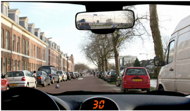
Fig. 1 Example of a photograph of the Action Selection Test in the assessment of risk-taking behavior

very unsafe responses. As an indication of risk-taking behavior, we used the sum score of unsafe and very unsafe responses, where a higher score indicates increased risk-taking behavior.