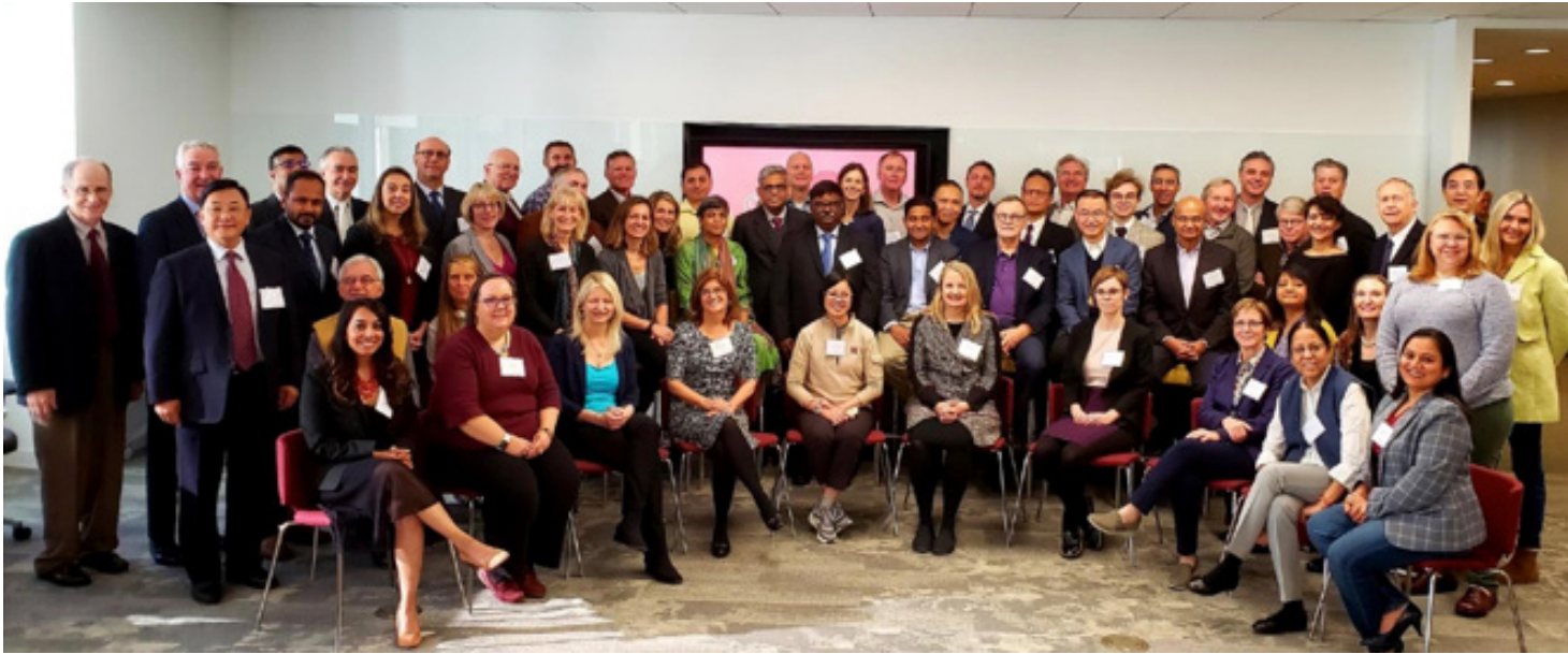
Fig. 2 – Group gathered during the first Children's HeartLink 50th Anniversary Summit 2019.