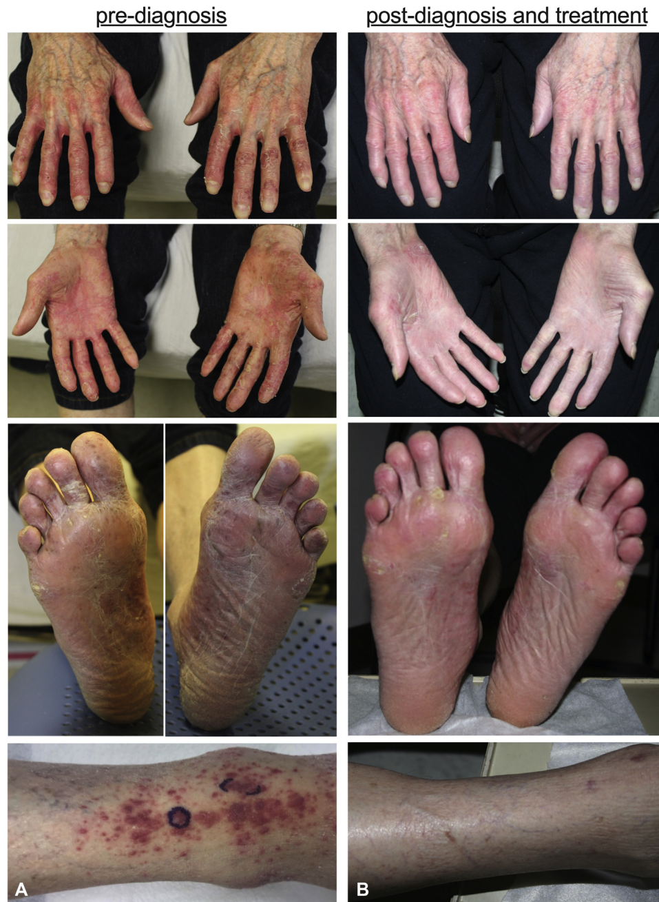
Fig 1. Mycosis fungoides palmaris et plantaris with peripheral blood involvement. Clinical images of hands, ankle, and soles ( A ) before diagnosis and treatment, and ( B ) 5 months after treatment with extracorporeal photophoresis, bexarotene, and spot electron-beam therapy to the palms.

CD8 + CD3 - CD5 var CD7 dim CD25 - CD26 var CD2 + CD10 - CD30 - CD57 - . Fluorescence in situ hybridization 4 results of peripheral blood mononuclear cells indicated normal copy number for ATM , TP53 , RB1 , CDKN2A , MYC , ARID1A , ZEB1 , STAT3 , and DNMT3A , suggesting that single-nucleotide mutations were likely driving this patient's clonal expansion. High-throughput sequencing of the TCRβ gene