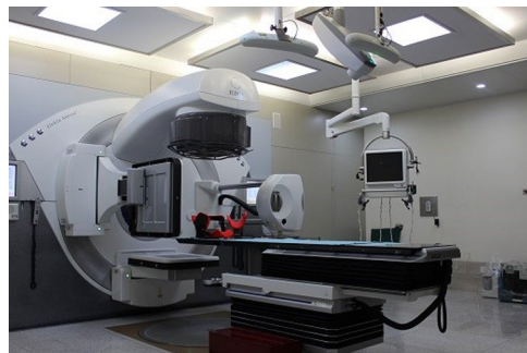
Figure 1. The image of Sentinel and CBCT positioning correction equipment.

For treatment planning, the CTV was delineated to include all breast tissues. The PTV was defined as the CTV with a 5 mm margin, modified to exclude the volume adjacent to the skin surface within 5 mm. The CTV-boost volume consisted of the tumor bed, as marked by the surgery metal clips, postoperative serum swelling and surgical scars. The PTV-boost was defined as adding 7 mm margin to the CTV-boost and modified to be inside the PTV. Organ at risk (OAR) delineated were the lung, heart, and contralateral breast.