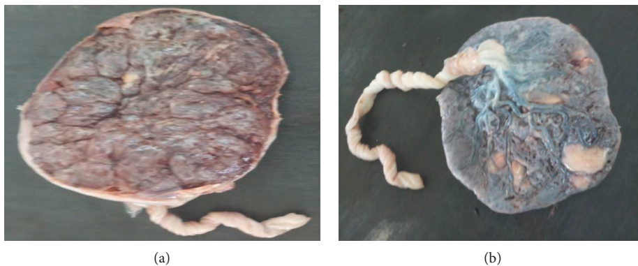
FIGURE 1: Gross morphology of normal placenta on maternal and fetal surfaces, respectively.