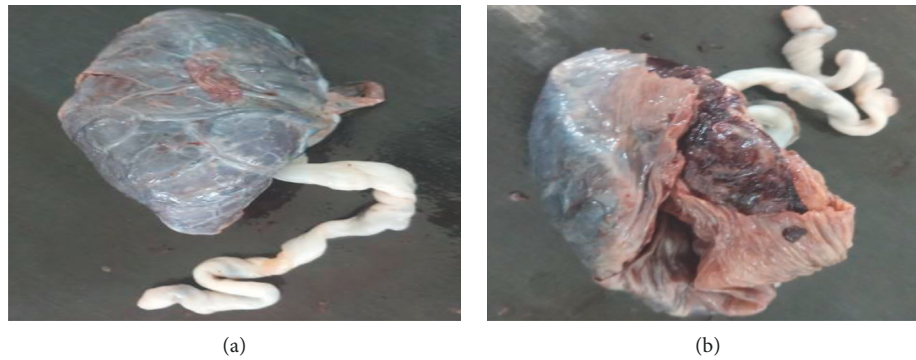
FIGURE 3: Gross morphology of abruption placenta on maternal and fetal surfaces, respectively.

The mean of FTP ratio in the normal group was 5.52 \pm 0.07 (mean \pm SEM), in PIH group was 5.15 \pm 0.11 (mean \pm SEM), whereas in abruption placenta group, it was 4.99 \pm 0.82 (mean \pm SEM). Normal group means FTP ratio showed highly significant difference ( p < 0.05 ) compared with PIH and abruption placenta group mean (Table 4).