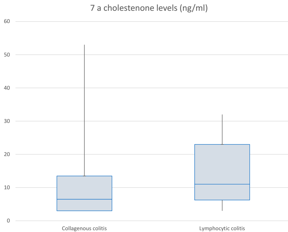
Figure 2 7-a. Cholestenone levels measured in collagenous and lymphocytic colitis.