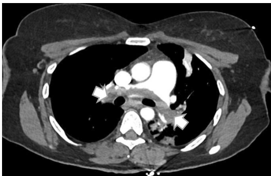
Fig. 1 The CT pulmonary angiography showing partially obliteration of the both right and left pulmonary arteries with thrombus, as indicated by white arrows

A 41-year-old woman presented to the emergency department with sudden death during physical activity. She had no known history of disease other than diabetes mellitus and she had no history of medication usage including oral contraceptives except insulin. According to the information received from the patient's relatives, she was asymptomatic until sudden death. Spontaneous circulation was achieved in the patient after 20 min of successful cardiopulmonary resuscitation. Since she had no spontaneous breathing, she was intubated, and mechanical ventilation was initiated. Laboratory tests displayed slightly elevated C-reactive protein level of 14 mg/L, leukocytosis of 14.010/\text{mm}^3 , modest increased troponin I level of 45 pg/mL and elevated D-dimer level of 7.29 \mu\text{g}/\text{mL} . She was afebrile but her nasopharyngeal swab reverse transcription polymerase chain reaction test was positive for SARS-CoV-2. Her measured blood gas