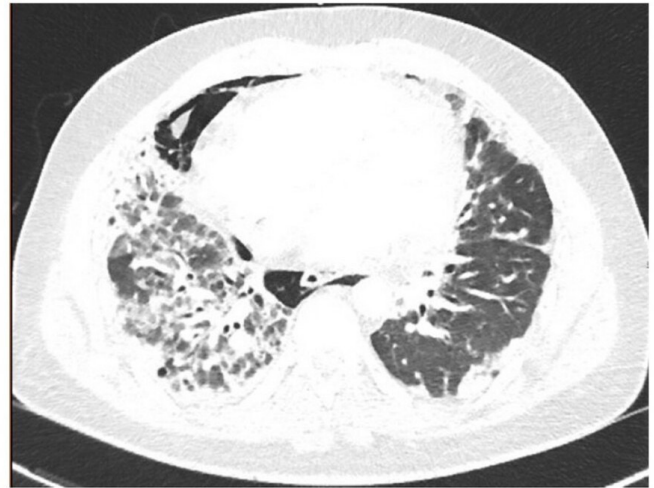
Figure 6 Extensive pneumomediastinum and subcutaneous emphysema throughout the visualised mediastinum, and consolidations of the right middle lobe.

Anti-MDA-5 antibody was first discovered in a Japanese population of amyopathic dermatomyositis patients in 2005. Autoantibodies were analysed from 298 patients with various connective tissue diseases, and anti-MDA-5 antibodies were detected in 8 of 42 patients with dermatomyositis. Those with anti-MDA-5 autoantibodies had significantly more rapidly progressive interstitial lung disease (ILD) when compared with patients without anti-MDA-5 autoantibodies. 1