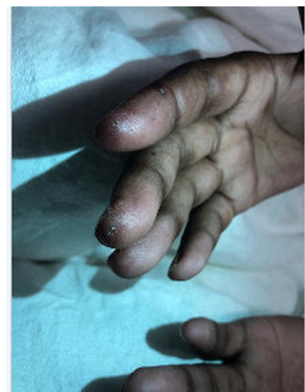
Figure 3 Distal digital hyperkeratosis with pinpoint pitting in the centre of the finger pad.