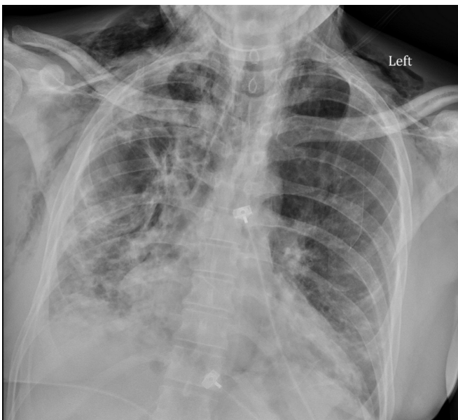
Figure 5 Subcutaneous emphysema and patchy infiltrates, right more than left.

protein, erythrocyte sedimentation rate and high positive anti-melanoma differentiation-associated gene-5 (MDA-5) antibody with normal creatine kinase and aldolase level. A chest X-ray showed subcutaneous emphysema, R>L patchy infiltrates and no pneumothorax (figure 5). CT chest showed extensive pneumomediastinum and subcutaneous emphysema throughout the visualised mediastinum and increasing consolidations at the right middle lobe (figure 6). The patient received cefixime for 14 days, steroid treatment (1 mg/kg of methylprednisolone), tacrolimus and rituximab, but was still unable to wean off of high-flow nasal cannula. Currently, he is being evaluated for a lung transplant.