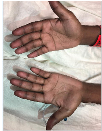
Figure 2 Mild erythema of the palmar aspects of the distal fingertips.

He returned to the emergency department 3 months later, and he was febrile to 39.2°C, tachycardic to the 130s–150 s, normotensive, tachypneic and hypoxic to the low 70s on 3L nasal cannula, thus prompting the initiation of high-flow nasal cannula. His arterial blood gas values were pH 7.5, Pco 2 32 mm Hg and PO 2 88 mm Hg. His ECG showed sinus tachycardia. Physical examination revealed bilateral inspiratory crackles, most appreciable at the basal third of the lung fields and normal strength on all four extremities. There was mild erythema of the palmar aspects of the distal