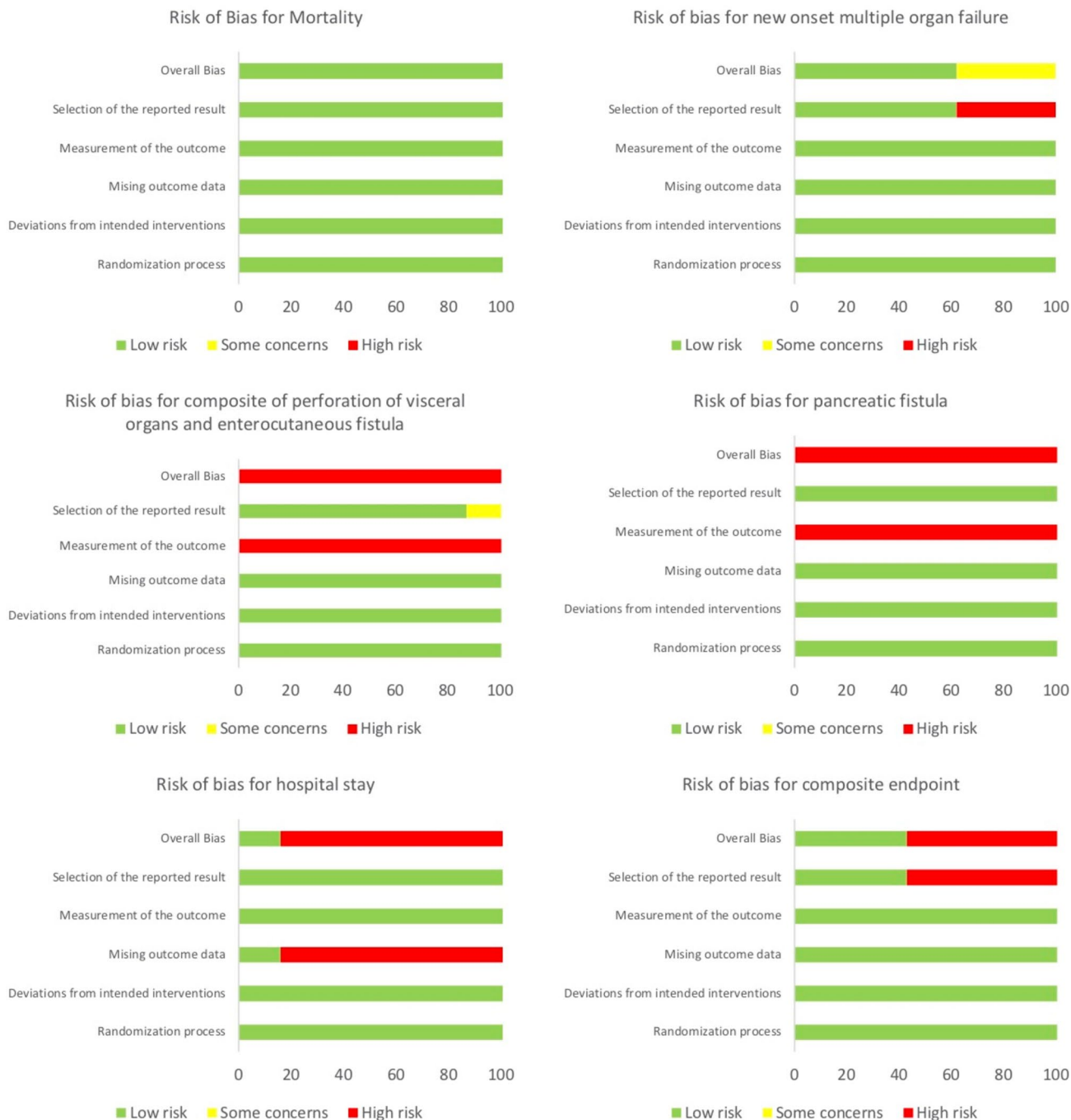
Fig. 2 Risk of Bias for most important outcomes, risk of bias assessed with the Cochrane Risk of Bias Tool 2.0, Risk of Bias for further outcomes presented in the Supplementary material

Both the outcomes pancreatic fistula and perforation of visceral organ/enterocutaneous fistula were rated as being of high risk of bias in all studies. This was because it was decided that there was a detection bias as both outcomes in part rely on presence of a percutaneous catheter or surgical wound site. As the endoscopic groups are less likely to have percutaneous drainage catheters and surgical wound even if