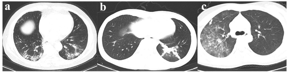
Fig. 3 Most common CT features of influenza pneumonia. a Ground-glass opacities with consolidation with a peripheral distribution. b Consolidation without ground-glass opacities. c Multiple nodules and tree-in-bud sign (arrow)

diameter were most likely to have a viral infection [23]. Nodules were present in 71% of the patients with influenza but in only 28% patients with COVID-19, which was consistent with a previous study [13]. Although each of the above sign is not specific, some combinations of the CT features may help better differentiate COVID-19 from influenza pneumonia: presence of pure GGO/rounded opacities/interlobular septal thickening and the absence of nodules; presence of pure GGO and interlobular septal thickening; presence of rounded opacities and interlobular septal thickening; and the absence of pleural effusion. Combining the above CT signs with predominant distribution in peripheral part of the lungs may help us differentiate COVID-19 from influenza.