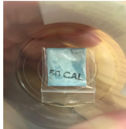
Image 2. A “50 CAL” drug packet retrieved from a patient, which contained heroin, synthetic cannabinoid, and fentanyl.

A 25-year-old man presented to the hospital by EMS after IV heroin use. The patient was found with a drug packet labeled “Santa Muerte” in his pocket and had CNS and respiratory depression. He was given a total of four mg of IN naloxone, after which he became flushed, tachycardic, and agitated with dilated pupils. On arrival to the ED, his HR was 158 beats per minute, BP was 215/158 mmHg, RR was 26 breaths per minute, SpO2 was 99% on room air, and oral temperature was 102.1° F. On exam, he had urinary retention and anhidrosis. He was given four mg of lorazepam and