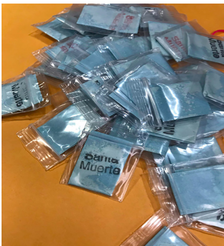
Image 1. Packets of “Santa Muerte,” a street heroin adulterated with synthetic cannabinoid, that were retrieved from a patient found unresponsive at home.

A 28-year-old man with a past medical history of bipolar disorder and polysubstance abuse including IV heroin, presented to the hospital by EMS after being found at home unresponsive. Family members found packets of drugs near the patient labelled “Santa Muerte (Image 1). On arrival, vital signs included a heart rate (HR) of 122 beats per minute, blood pressure (BP) 134/78 millimeters of mercury (mm Hg), respiratory rate (RR) of 38 breaths per minute, oral temperature 98.2 degrees Fahrenheit (F), and oxygen saturation (SpO 2 ) 78% on non-rebreather mask. Physical exam included tachycardia, flushing, dry mucous membranes and mydriasis. The patient was initially given two milligrams (mg) of intranasal (IN) naloxone in the field by EMS secondary to central nervous system (CNS) and respiratory depression, with no response. He was given a second dose of two mg IN naloxone and became agitated and combative. The patient was intubated upon ED arrival for hypoxic respiratory failure. Chest radiograph showed signs of aspiration pneumonitis, which developed into acute respiratory distress syndrome (ARDS) requiring venovenous extracorporeal membrane oxygenation (VV-ECMO). Head computed tomography was negative for acute intracranial abnormality. Complete blood count (CBC) and basic metabolic panel (BMP) were unremarkable. Urine drug screen immunoassay was positive for cocaine, opiates, fentanyl, tetrahydrocannabinol