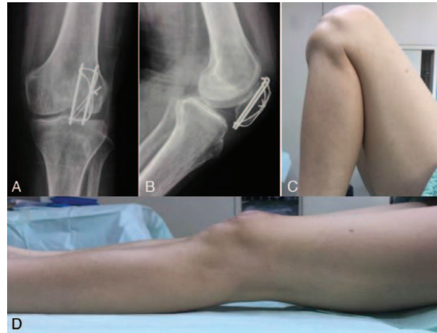
Figure 2. (A) Anteroposterior and (B) lateral radiographs at 1-year post-operatively showed perfect healing of the patella fracture. (C) and (D) Functional photograph of the left knee showing an excellent range of motion of the injury knee.