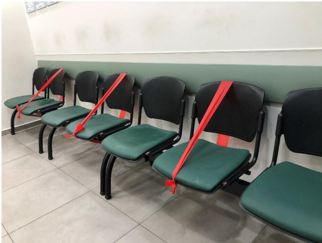
Figure 2 Waiting area.

calling the patient in advance, as well as at the front desk once the patient arrives at the clinic.