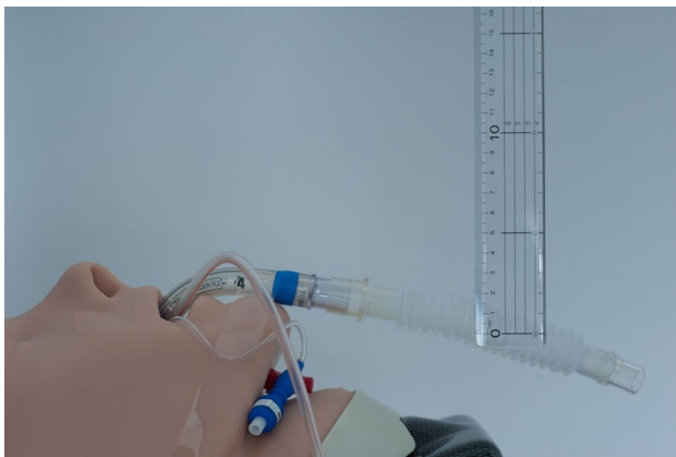
Fig. 2 Legend: LMA Classic with an orogastric tube

higher seal pressures and a built-in drainage port allows the insertion of a gastric tube through the gastric channel for gastric decompression. Presence of gastric fluid within the drainage port also serves as an early warning of regurgitation allowing for prompt management to avoid pulmonary aspiration. Appropriate use of SGA is not associated with increased aspiration risk, as supported by a systematic review, which demonstrated similar incidences of regurgitation with the use of supraglottic airway devices with built-in