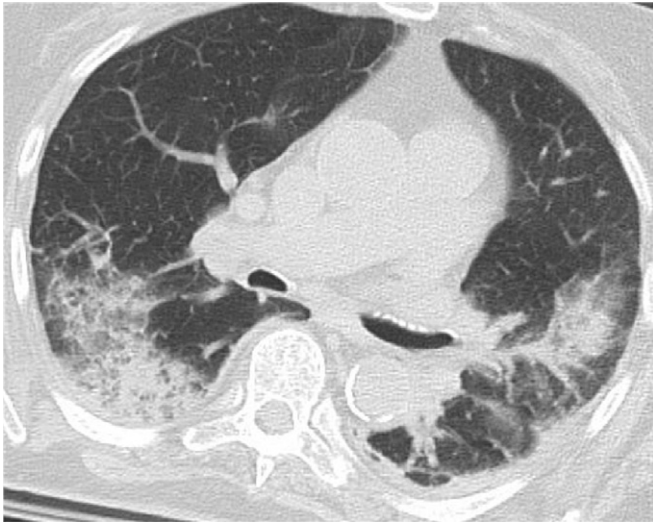
Fig. 1 Preoperative CT scan showing bilateral patchy consolidation and multiple ground-glass opacities.

42.1%), 31-A2 (5 fractures; 26.3%), 31-B2 (5 fractures; 26.3%), or 31-B33 (1 fracture; 5.3%) 5 . Three patients had no history of fever or respiratory symptoms and were excluded from the study. Sixteen patients had reported fever and shortness of breath 3 to 7 days before hospitalization, and all had accidentally fallen at home with no signs of head injury. All 16 patients presented with symptoms of fever and oxygen desaturation on ambient air; 14 of them needed respiratory support. Clinical features, comorbidities, and the type of assisted ventilation administered at the time of hospitalization for symptomatic patients are shown in Table I . All patients were tested with thoracic computed tomography (CT) screening and oropharyngeal swabs ( Fig. 1 ). The 3 asymptomatic patients with no signs of interstitial pneumonia on the CT scan and no requirement for ventilatory support were promptly transferred to a clinic close to our hospital (Humanitas Gavazzeni, Bergamo, Italy), to which patients are usually assigned for same-day procedures or relief hospitalization, to await the result of the swab test before treatment.