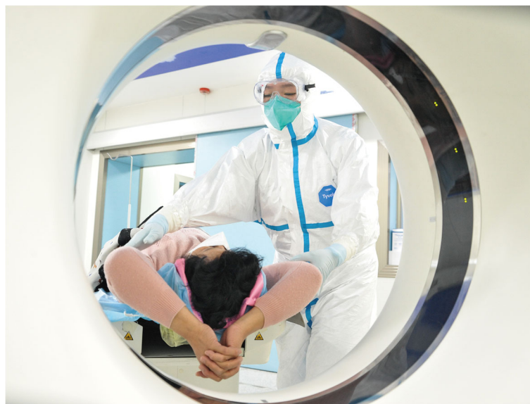
Fig. 1 Level 3 PPE during CT examination

If possible, nasopharyngeal swabs, sputum, lower respiratory tract secretions, and blood samples should be collected and sent for rRT-PCR in the emergency period. If no respiratory tract specimens are collected before the operation due to time constraints, they can be collected during or after the operation.