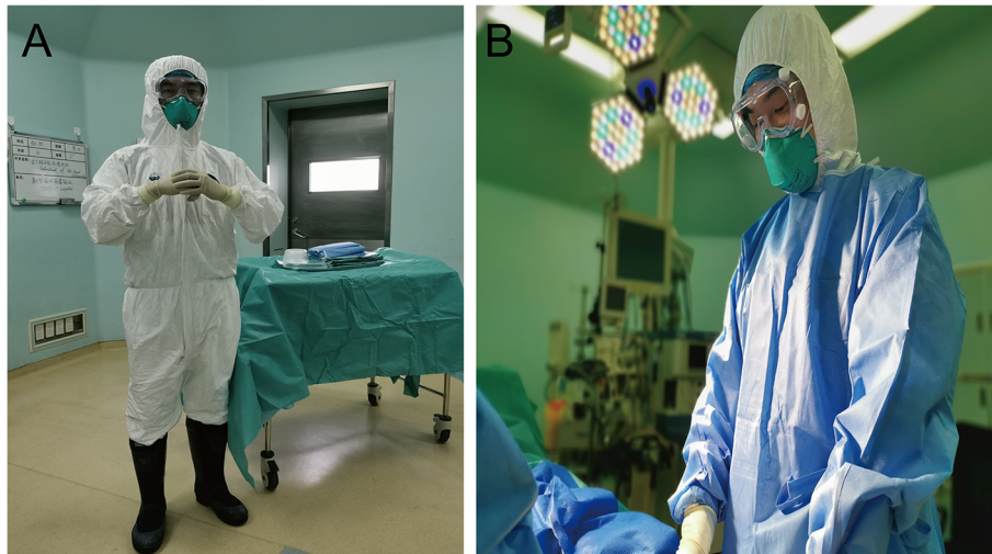
Fig. 2 Protective clothing for surgical personnel: a after wearing protective clothing and inner gloves, b after wearing operating clothes and outer gloves