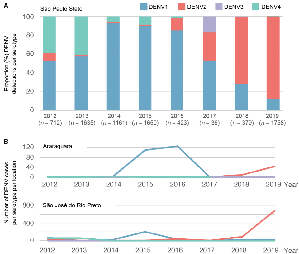
Fig. 1: annual number of dengue virus (DENV) cases by serotype reported to the Centro de Vigilância Epidemiológica (CVE), São Paulo State, Brazil, between January 2012 and June 2019. (A) Proportion (percentage) of dengue cases by serotype reported in São Paulo State (total n = 7754). (B) Number of dengue cases by serotype in Araraquara (total n = 294) and in São José do Rio Preto (total n = 1347).

Epidemiological information on the number of confirmed dengue cases with associated serotype information shows that all four dengue serotypes co-circulate in Sao Paulo State (Fig. 1A). While in 2012 DENV1 (52%, n = 373/712) and DENV4 (39%, n = 274/712) predominated, DENV 2 (9%, n = 64/712) and DENV3 (0.1%, n =