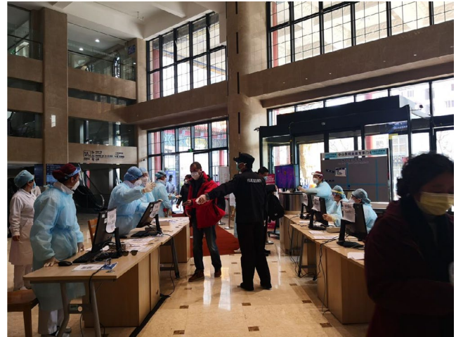
FIGURE 2 Entrance of outpatient department: conducting temperature check and epidemiological survey

Zhongshan Hospital of Fudan University is a general hospital listed as the top 5 academic centre in China and is one of the assigned