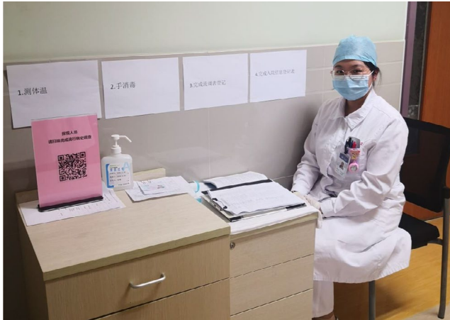
FIGURE 3 Four steps to complete entrance check in inpatient ward: temperature check; hands disinfection; epidemiological survey; visiting information record

sentinel hospitals with fever clinics. A hospital-wide COVID-19 committee was set-up and initiated a response framework to prevent and safeguard patients, family, and staff from COVID-19 infection. We briefly present our response framework, including procedures, human resources, patient management, and staff emotional support, to share our experiences in this global health emergency.