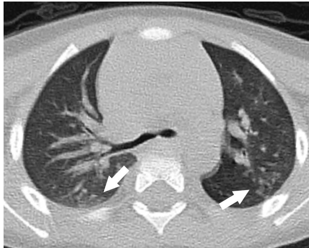
FIGURE 2. High-resolution CT of a 2-year-old asymptomatic boy showed subpleural GGO in bilateral upper lobes.