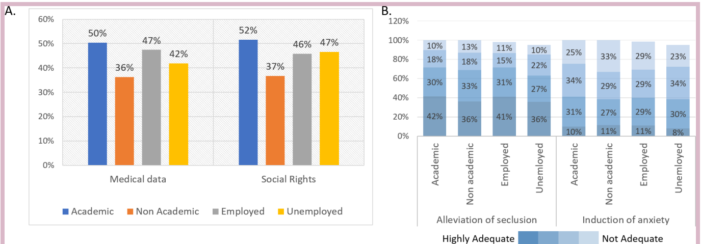
Figure 2 Stop cancer users by education and employment (A) Seeking information by education (academic—college/university; non-academic—high school) and employment status (B) Psychosocial impact—alleviation of seclusion versus induction of anxiety.

of treatment received. The social network had an allocated section for ‘patient mentoring’ of newly diagnosed members by survivors, which is an interesting addition to an online platform.