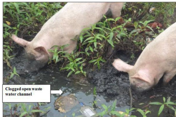
Figure 2. Showing two domestic pigs ( Sus scrofa domesticus ) scavenging for some edibles from the open waste water channel near the gate of Kartasi industry (F), Nairobi. Note: the open waste water channel was clogged with solid wastes (papers and plastic containers), mud and overgrown vegetation (The photograph was captured using a digital camera).

whether the level of pollution in the open channels was above the locally and internationally accepted standards in addition to making reliable conclusions.