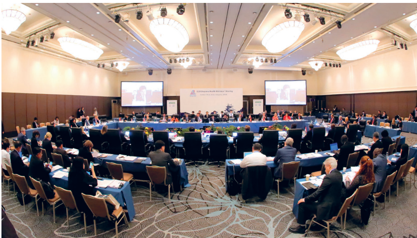
Photo: Health Ministers engaging in discussion to make progress in global health (from the website of the Ministry of Health, Labour and Welfare of Japan, used with permission. https://www.mhlw.go.jp/seisakunitsuite/bunya/hokabunya/kokusai/g20/health/jp/photos_g20okayama.html ).

issue, and strengthened efforts to improve global health risk management and tackle AMR. As indicated in the article published after the G20 Osaka Summit on July 6 [10], we believe that concrete actions by G20 members based on the Declaration are now needed to make substantial progress in global health. In 2020, the Saudi G20 Presidency proposed "Enabling Person-Centered Health Systems" with a focus on value-based health care and digital health solutions as the main pillar of the health agenda [11]. We hope that the next Presidency will accelerate progress in global health, building on the legacy of the previous G20 HMM.