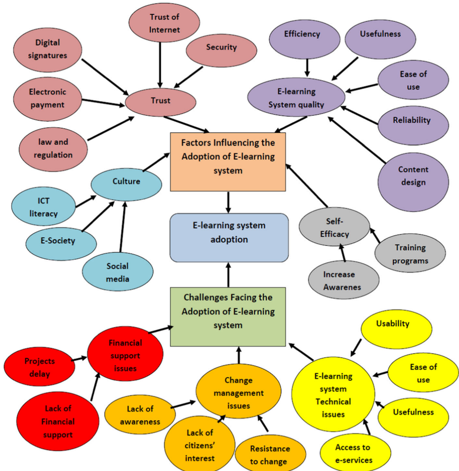
Fig. 3 The critical challenges and factors of E-learning system usage framework during COVID-19 pandemic

As noted by the interviewees, the interviewees agreed that change management is one of the challenging issues, since it touches government policies and legislation, students, and instructors. The interviewees outlined, “We think it is challenging because the