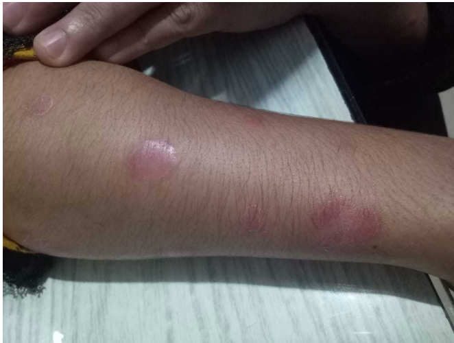
Figure 1 Cutaneous lesions in the patient: well-defined erythematous plaques with silvery scales.

family history of BP or psoriasis. There was also an interesting association between bipolar cyclicality and exacerbation of psoriatic lesions and remission episodes. Our patient reported having manic episodes consecutively for the last 5 years, and with each episode there was worsening of psoriatic lesions even before starting psychotropic medications and a reduction in lesions during remission. Another past report showed an exacerbation in psoriatic lesions during depressive episodes and a dramatic decrease during a hypomanic episode and in remission. 5