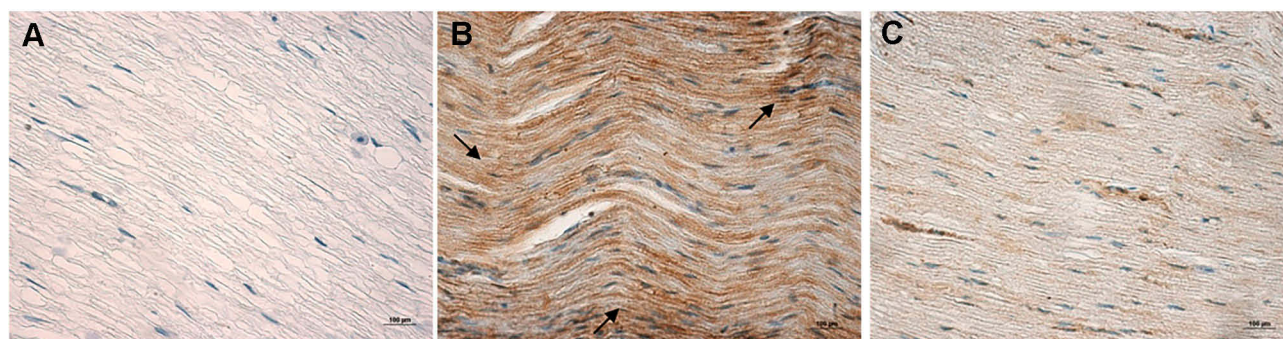
Figure 3 Immunohistochemical staining ( \times 400 ) for PARP expression of the sciatic nerve. No brown staining observed in the sciatic nerve tissue of the NC group (A). In the DM group, many brown-stained particles can be seen (B). After LA treatment, the sciatic nerve showed a light brown color, almost similar to that of the NC group (C). Abbreviations: PARP, poly ADP-ribose polymerase; DM, diabetic model; LA, lipoic acid treatment; NC, normal control.