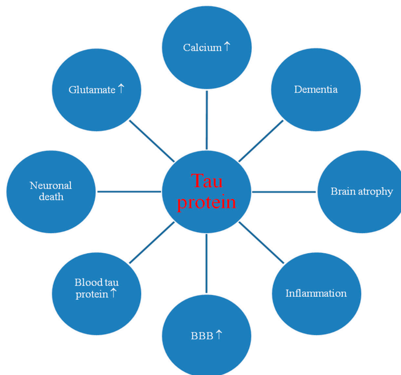
Figure 2. Potential pathological role of tau protein during ischemia-reperfusion brain injury. BBB: blood-brain barrier. ↑: increase.

The results show that ischemic brain damage causes neuronal death in the hippocampus in a tau protein-dependent mechanism, defining a new and very important process that ultimately regulates neuronal survival and/or death after ischemia (Figure 2) [63].