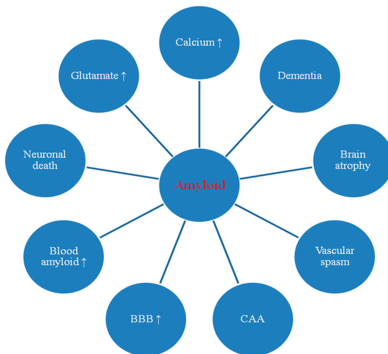
Figure 1. Potential pathological role of amyloid during ischemia-reperfusion brain injury. BBB: blood-brain barrier; CAA: cerebral amyloid angiopathy; ↑: increase.

and the development of dementia with the phenotype of Alzheimer's disease. The results show that ischemic brain damage causes amyloid-dependent hippocampal neuronal death, thus defining a new, very important mechanism that ultimately determines survival and/or death of neurons after ischemia (Figure 1).