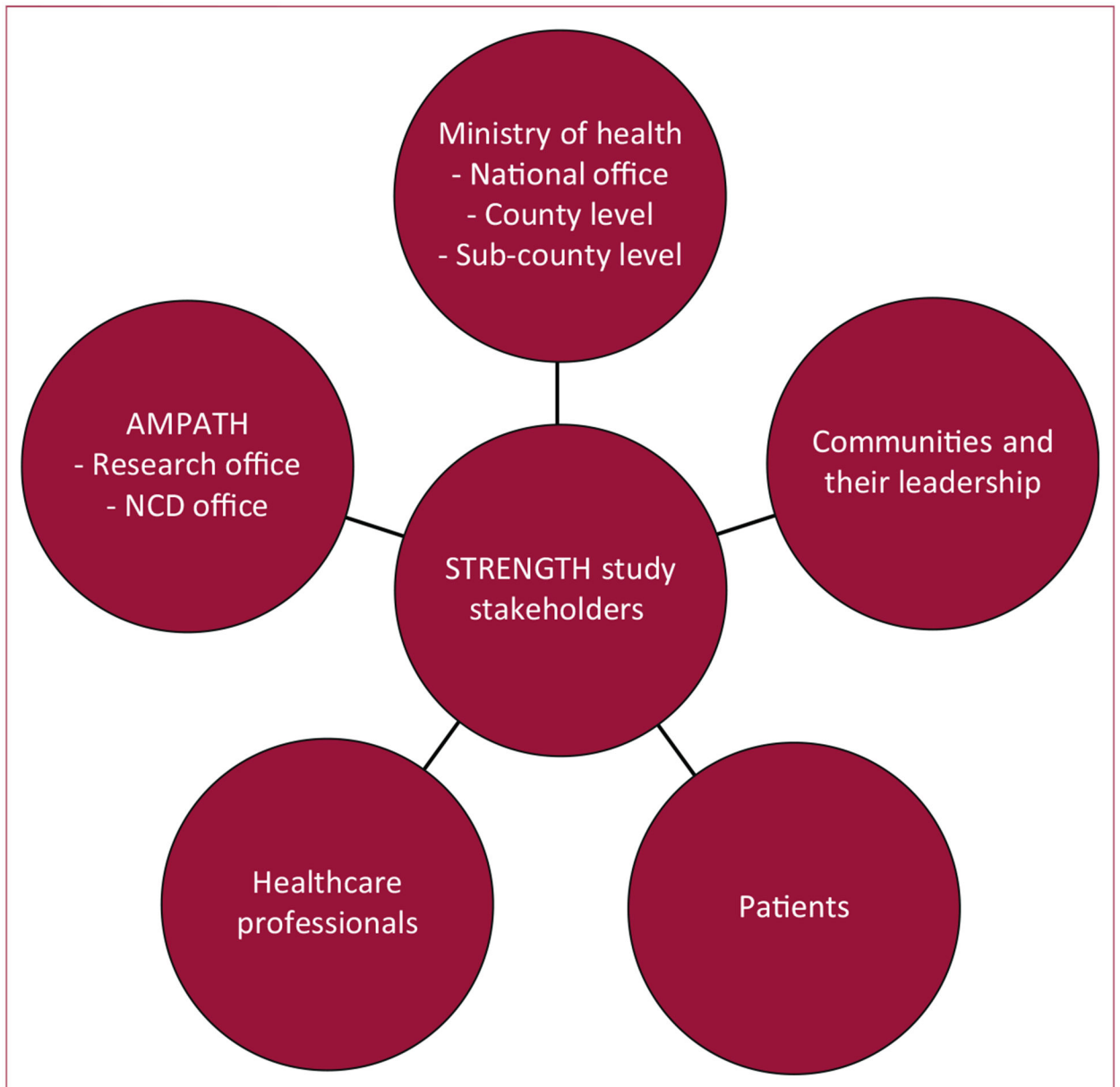
FIGURE 2. STRENGTHS (Strengthening Referral Networks for Management of Hypertension Across Health Systems) study stakeholder map.

AMPATH, Academic Model Providing Access to Healthcare; NCD, noncommunicable disease.