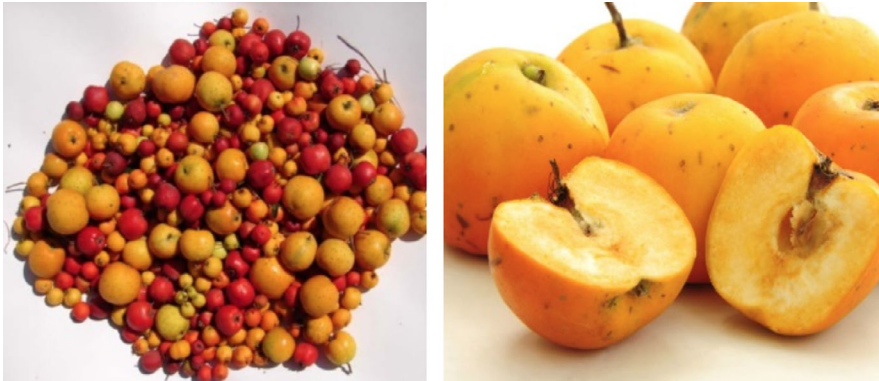
FIGURE 2 Tejocote fruit. Source Ref. 26

platelet destruction is also mediated by cytotoxic T cells and cellular immunity rather than humoral immunity. 2 Thrombocytopenia from ITP often manifests as mucocutaneous bleeding, petechial rash, spontaneous bruising, and rarely, intracranial hemorrhage. 4