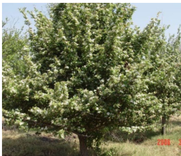
FIGURE 1 Tejocote Tree. Source Ref. 26

Thrombocytopenia is defined as a platelet count below the lower limit of normal ( <150 \times 10^3/\mu\text{L} ). While there are many etiologies of thrombocytopenia, including peripheral destruction, decreased bone marrow production, and increased splenic sequestration, a frequent entity for severe isolated thrombocytopenia is ITP. ITP, formerly known as idiopathic thrombocytopenia purpura, is an acquired autoimmune condition where IgG type antibodies are directed against platelet membrane glycoproteins IIb-IIIa leading to peripheral destruction. 1 While antibody and complement mediated platelet destruction by macrophage clearance in the reticuloendothelial system is felt to best explain the disease process, the pathophysiology remains incompletely understood. 2 In fact, up to 50% of patients with ITP will not have detectable autoantibodies and such antibody testing is not felt to be part of standard diagnostic workup. 3 The lack of identifiable antibody formation might be due to a second mechanism of platelet clearance, namely, that