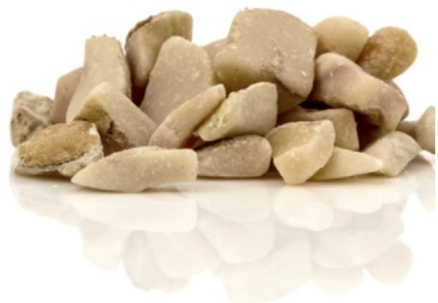
FIGURE 3 Alipotec supplement. Source Ref. 26

ITP has established criteria to gauge treatment response. 24 Following holding of the Alipotec, our patient had a complete response of her ITP, as defined by a platelet count of greater than 100 \times 10^3/\mu\text{L} measured on two occasions 7 days apart. At the time of writing this case, the patient has remained with a platelet count of greater than 300 000 over the past 12 months with her last platelet count of 415 \times 10^3/\mu\text{L} while remaining off the Alipotec (Graph 1).