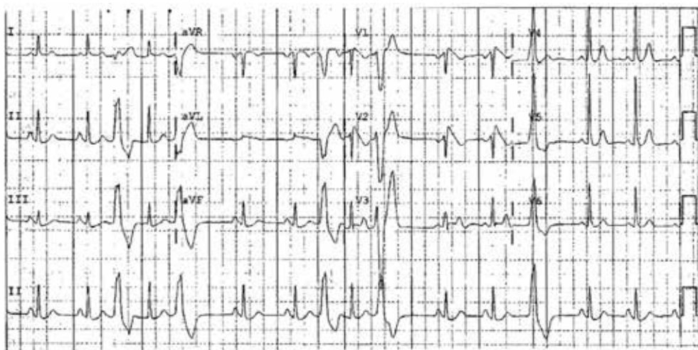
Figure 2: ECG obtained five months before the cardiac arrest. The presence of type I Brugada pattern was not recognized; rather, the patient underwent an unremarkable "ischemia evaluation" given the presence of ST-segment elevation in leads V1 and V2.

He received a dual-chamber implantable cardioverter-defibrillator (ICD) (an atrial lead was implanted to permit atrial pacing for managing severe nocturnal bradycardia) and was discharged home. Four weeks later, he received several ICD shocks for ventricular fibrillation (VF) storm while asleep. He was admitted and quinidine sulfate was initiated. This was changed to quinidine gluconate ER 324 mg due to the unavailability of the former. Subsequently, after a few days, he developed angioedema every time he took quinidine.