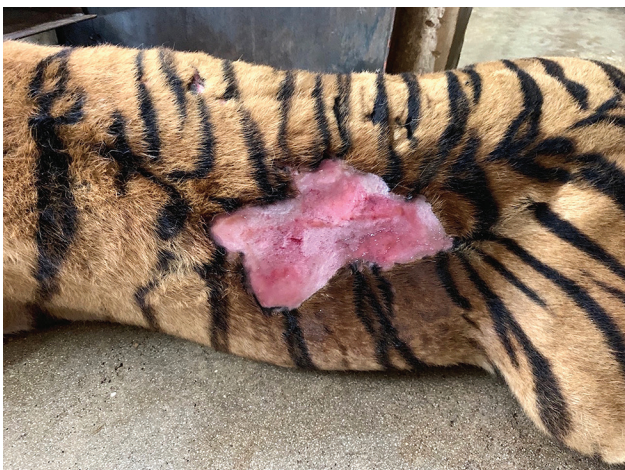
Figure. Large nonhealing laceration, attributable to Leishmania infantum infection, extending from the left loin region to the left thoracic region of a tiger, southern Italy.

During May–November 2019, we collected a total of 580 sand flies. The most abundant species was Phlebotomus perniciosus (n = 491), followed by Sergentomyia minuta (n = 69) and P. neglectus (n = 20). Of the 190 females collected, 151 (26%) were P. perniciosus , 4 (<1%) were P. neglectus , and 35 (6%) were S. minuta . Specimens for 8 (5.3%) P. perniciosus sand flies and 1 (2.9%) S. minuta sand fly tested positive for L. infantum DNA. Of the 190 females examined, 63 (33.1%) P. perniciosus , 3 (1.6%) P. neglectus , and 2 (1.1%) S. minuta sand flies tested positive for tiger DNA (Table 2); we detected no other mammalian DNA (e.g., from cats, dogs, rats, or humans) in blood-fed or -unfed specimens.