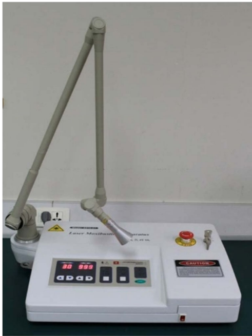
Fig. 2 SX10-C1 10.6- \mu\text{m} infrared laser moxibustion device

In ISRCTN68475405, a stick-on moxa cone was used in the traditional moxibustion group patients (Fig. 3). The stick-on moxa cone consisted of a moxa cone (1.8 cm in diameter) and a cylindrical base (8 mm high). The patients were told to either lie on their backs or sit in a position that would leave both knee joints completely exposed. Three points (ST35 Dubi, EX-LE4 Neixiyan, and Ashi point) were stimulated bilaterally in the treatment. The moxa cones were ignited after being attached to the acupoints. When the patients felt burning at the skin, the moxa cone was removed and a new one would be attached and ignited again. All points received 3 cones in each session. Each patient received a total of 18 treatments over 6 weeks with 3 sessions a week, and the treatment was also given once every other day.