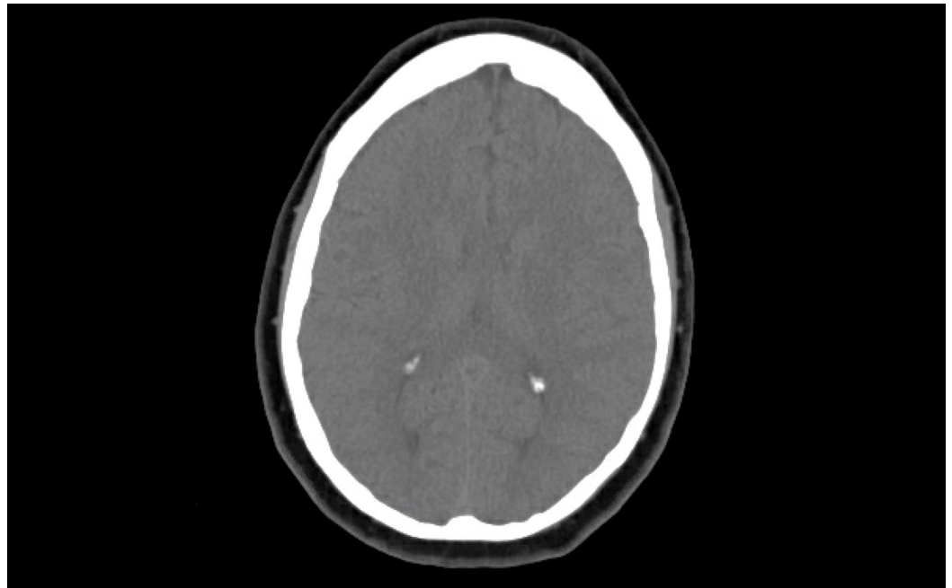
FIGURE 1: CT head without contrast

In the ED, her initial vital signs were: temperature 98.1°F, blood pressure 142/81 mmHg, respiratory rate 18 breaths per minute, heart rate 84 beats per minute, and oxygen saturation 95% on ambient air. Physical examination was completely unremarkable. The only abnormal laboratory results were: erythrocyte sedimentation rate (ESR) 31 mm/hr, alanine transaminase (ALT) 31 U/L. Computed tomography (CT) head without contrast showed no acute intracranial abnormality (Figure 1). Her headache was thought to be related to trigeminal neuralgia and was prescribed Gabapentin 300 mg twice a day. There were also concerns for possible COVID-19 infection due to anosmia and ageusia but additional testing was deferred due to the lack of fever, respiratory distress, and laboratory abnormalities. This decision was made upon extensive discussion with the infectious disease specialist, as the clinical suspicion for COVID-19 was extremely low because it could be related to her seasonal allergies. The patient remained stable overnight.