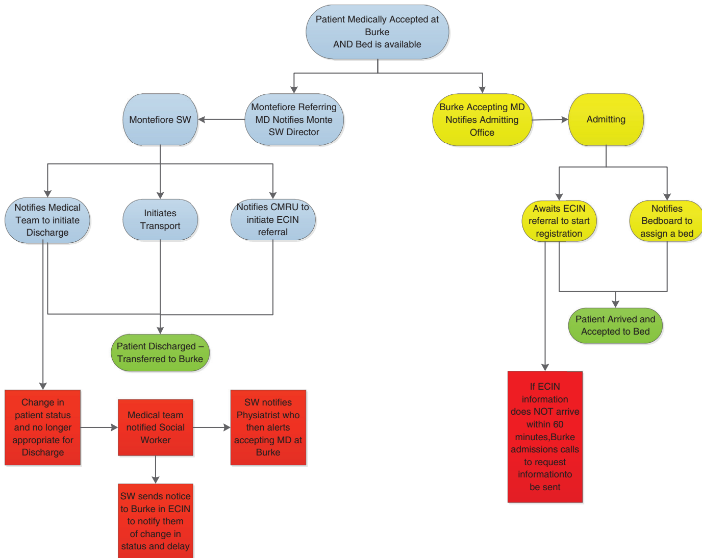
Figure 1 Montefiore to Burke. Acute rehabilitation transfer protocol during COVID-19 emergency. CMRU = Care Management Resource Unit; ECIN = Extended Care Information Network; SW = social worker

emergency departments, ultimately improving patient flow. It was also essential to work together and coordinate between all system hospitals for rapid testing and other processes that allowed more rapid movement of patients. It is vital that, beyond their medical value, departments of rehabilitation medicine be acknowledged as integral parts of healthcare systems’ throughput pathways, especially in times of medical crisis.