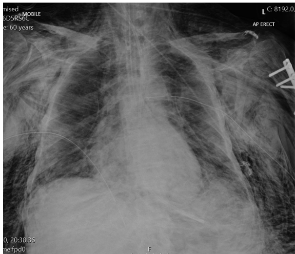
Figure 1 Chest X-ray demonstrating significant surgical emphysema, pneumomediastinum and pneumopericardium in an intubated COVID-19 patient. Bilateral intra-pleural chest drains can be visualised.

attached to vacuum assisted closure pumps were advised to ensure a closed circuit in order to avoid aerosolising the virus as best possible [1].