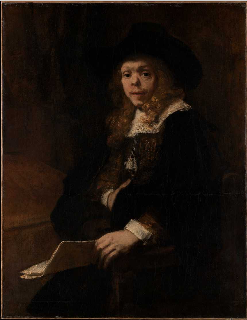
FIG 4 1665 portrait of renowned painter, poet, and public intellectual Gérard de Lairesse (1641 to 1711), by Rembrandt Harmenszoon van Rijn (1606 to 1669). Lairesse's facial deformities caused him to be shunned by some contemporaries; they are now thought to have resulted from congenital syphilis. ( https://www.metmuseum.org/art/collection/search/459082 ; public domain.)

ized almost all pandemics, and now we are experiencing shock at the overwhelming of hospitals and the hastily dug mass graves associated with COVID-19.